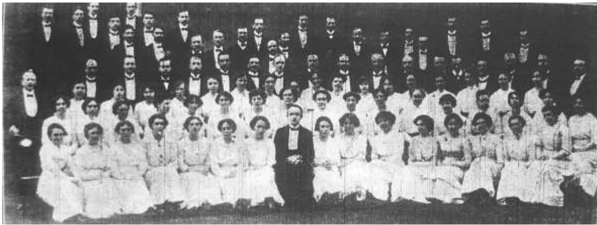
The choir in 1914