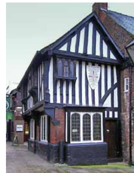
THE ROYAL OAK

Continue ahead to the cross roads, turn left into Packers Row and then right into the Shambles. The area retains the layout of about 1200 when the new market place opened because the market place north of the church had outgrown its space. Continue straight ahead to the Royal Oak (3) . There were several butchers in the area who slaughtered the cattle on site with the blood draining down the open drains in the centre of the passage (now covered by the oblong slabs). The timber framed section of Royal Oak originally housed two butcher's shops, which were heavily restored in the 1890s, and the timber framed section was joined to the brick built section. Unfortunately the building's plaque is mostly incorrect!