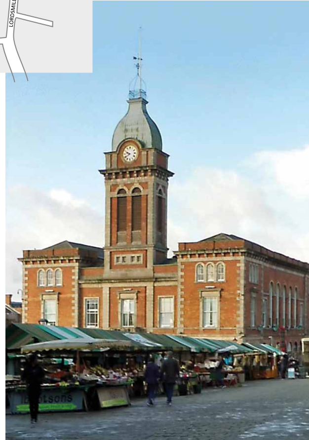
THE MARKET HALL

Turn left down one of the alleys either side of the building and turn left again. Before crossing the road look up at the corner of the former John Turner's department store. Built in 1925, when Tudor Revival buildings were popular, a second storey was planned but never built apart from the corner. Cross the road to the Yorkshire Building Society (4) which dates back to the 16th century. It later became the Falcon Inn.