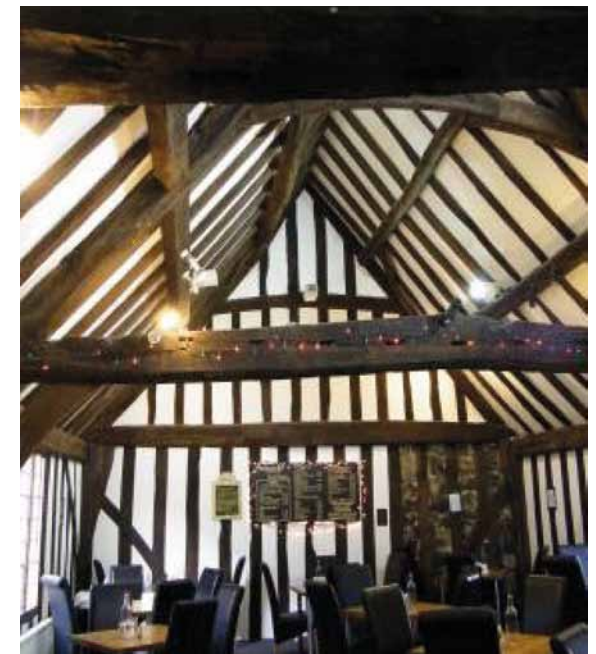
THE ROOF AND A CUT-AWAY SECTION OF WALL REVEALS THE CONSTRUCTION AND FORMER SECRETS OF THE PEACOCK (5)

When Chesterfield became a Municipal Borough in 1836 it occupied approximately a half square mile and the built area one third of that. The population increased rapidly from 1840 onwards following the arrival of the railways, the opening of coal mines and the growth of heavy engineering.