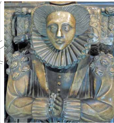
AN EFFIGY FROM THE FOLJAMBE CHAPEL IN THE PARISH CHURCH OF ST MARY AND ALL SAINTS.