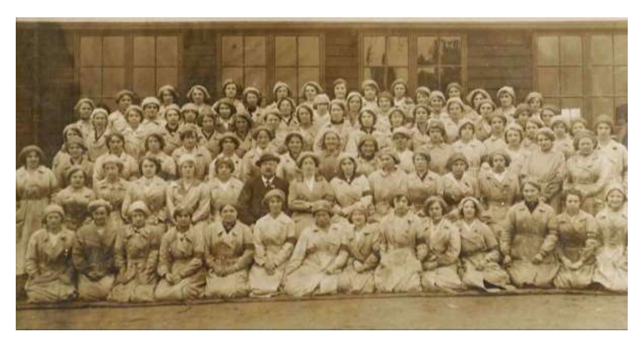
Patent Electric Shot Firing Company

The Patent Electric Shot-Firing Company was another big employer of women for the manufacture of fuses and detonators for Mills bombs – dangerous work!